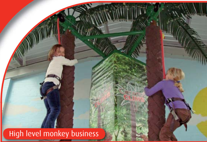
High level monkey business