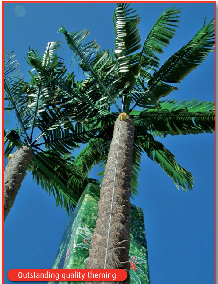
Outstanding quality theming